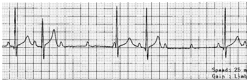
Figure 1. Asymptomatic Bradycardia in an 18-Year-Old Male Athlete.

This electrocardiographic tracing was obtained while the patient was relaxing after lunch. The tracing shows vagally mediated sinus slowing and atrioventricular block with one junctional escape beat. Similar rhythms were noted while the patient was sleeping. On the same 24-hour recording, sinus rates of more than 180 beats per minute, with a normal PR interval, were seen during exercise. No symptoms developed during long-term follow-up without therapy.